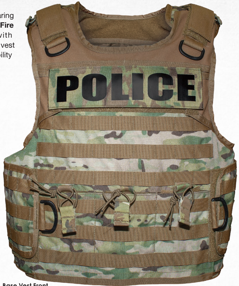
Base Vest Front