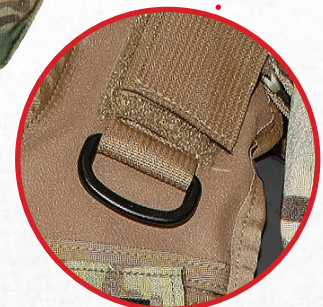
Rapid Release System in the shoulders and waist for rapid doffing